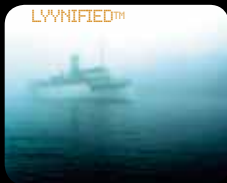
FOG & HAZE – LYYN gives you a clearer vision