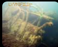
SUB SEA – LYYN gives you a clearer vision

LYYN AB Ideon Science Park SE-223 70 Lund, Sweden Phone: +46 46 286 57 90 info@lyyn.com www.lyyn.com