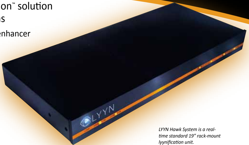
LYYN Hawk System is a real-time standard 19" rack-mount lynnification unit.

The real-time lynnification™ solution for analog CCTV systems 19" rack-mounted visibility enhancer