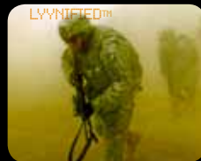
DUST – LYYN gives you a clearer vision