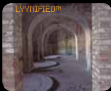
LOW LIGHT – LYYN gives you a clearer vision