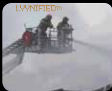
SMOKE – LYYN gives you a clearer vision