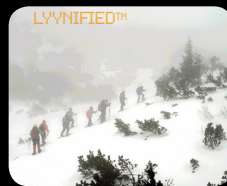
SNOW – LYYN gives you a clearer vision