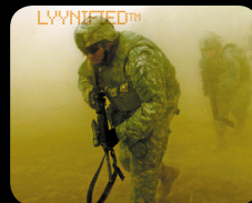
DUST – LYYN gives you a clearer vision