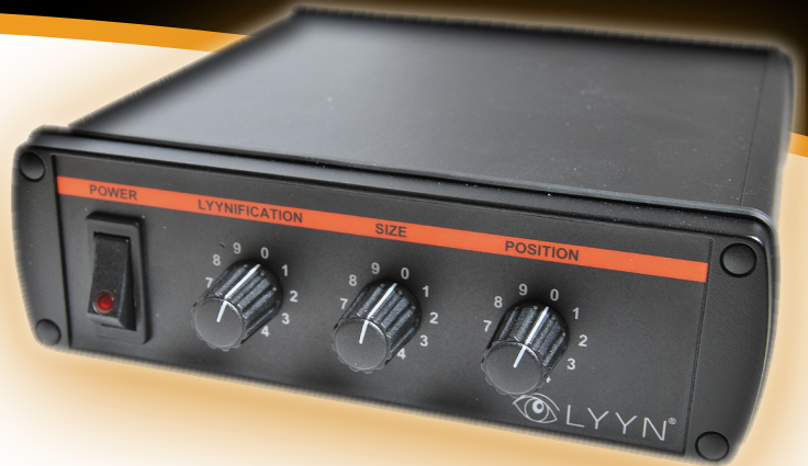
LYYN Hawk Portable™ is the real-time lynnification™ solution for desktop as well as in the field applications

The portable and easy to use LYYN® solution for real-time analog video