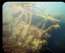
SUB SEA – LYYN gives you a clearer vision

LYYN AB Ideon Science Park SE-223 70 Lund, Sweden Phone: +46 46 286 57 90 info@lyyn.com www.lyyn.com