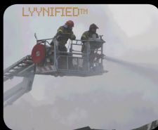
SMOKE – LYYN gives you a clearer vision