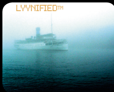
FOG & HAZE – LYYN gives you a clearer vision